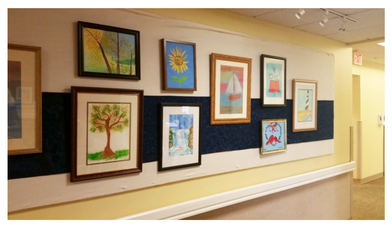
An art gallery was created with resident art; $100 provides art therapy for seven residents.