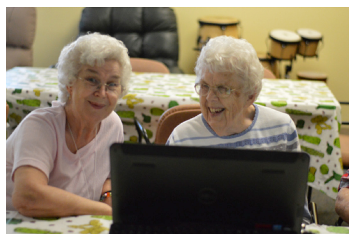
Touch screen technology and access to Linked Senior supports life enrichment to all residents and provides engagement for individuals with dementia or limited physical/cognitive abilities.

staff to use the technology in large and small group settings with a simple, scalable and effective platform.