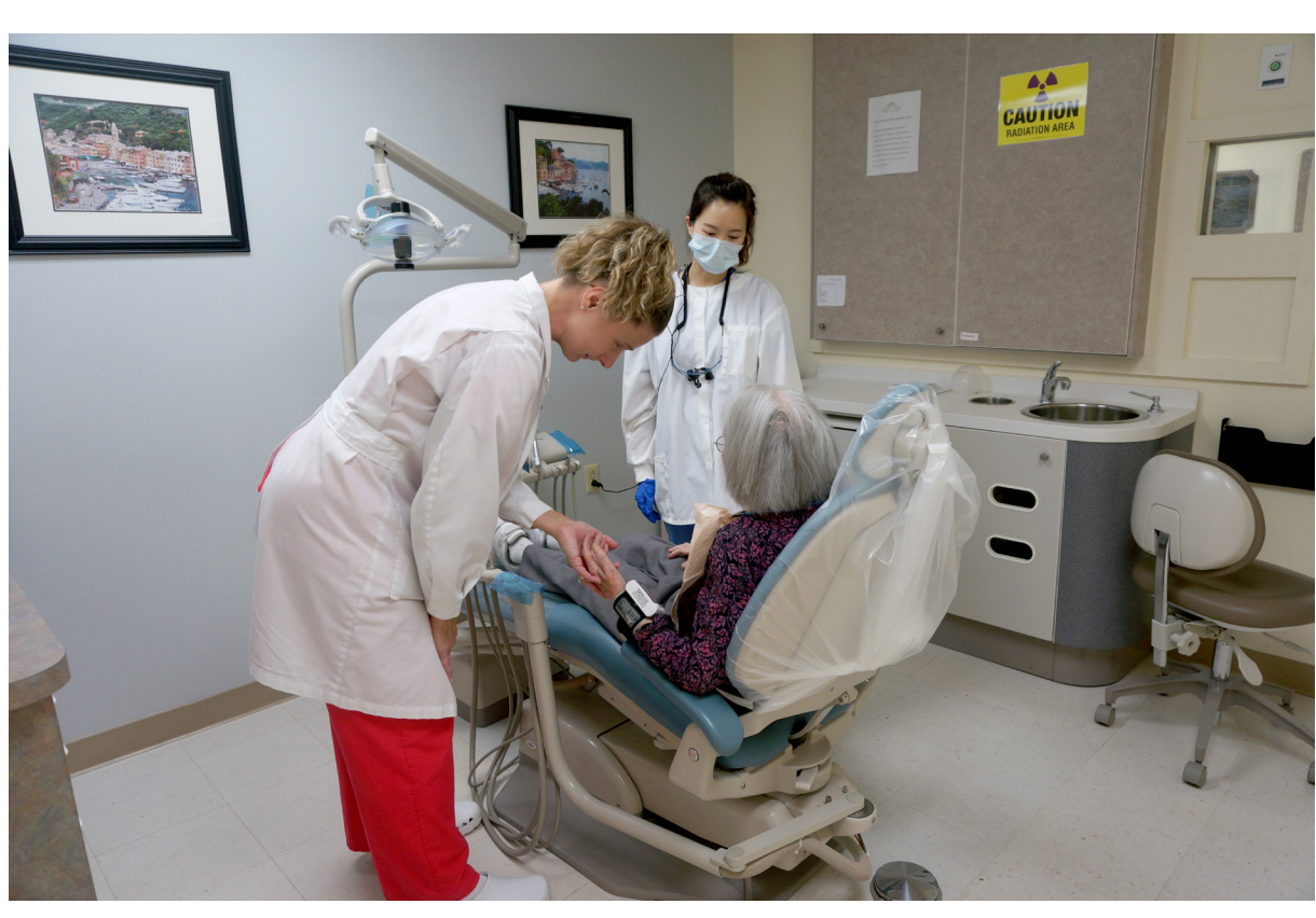
In addition to being a preceptor site for VCU School of Dentistry, the Lucy Corr Free Dental Clinic (LCFDC) also hosts students from ECPI, Fortis College and Centura College.